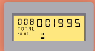
The meter reads 001995 .

To read an Electronic digital display meter, you need to press the button labelled "Display". This will make the meter scroll through a series of displays. Note each of the readings that appear.