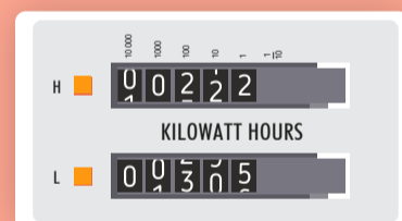
The meter reads H 00222 and L 00305 .

Note that they will typically be marked with a H (High/Peak) and a L (Low/Off Peak), ensure you note the H/L correctly against the relevant reading.