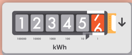
The meter reads 123456 .

These meters provide a straight readout of your total consumption. To read these meters, simply record the numbers in the same order as they appear on the meter.